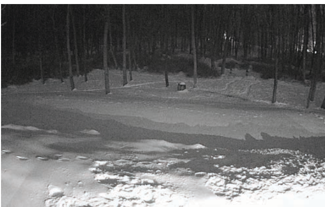
Low light images from the IP OiMD1 are almost unusable ( top ). Other similarly priced cameras have better low light response ( bottom ). Both pictures show the same scene at the same time.

pects of the camera in low light conditions. When I set the camera up overlooking a dimly lit area I expected to see some pixilation at first; what I saw was a mostly unusable image. I went in and performed several menu changes on the unit in an attempt to amp up the camera's performance at night. First I forced the unit from auto to night, disabling the IR cut filter. Next I changed the Intensifier preset setting from indoor to low light. Following that I changed the dynamic noise reduction to 20 (maximum selection) and changed the sharpness to 10 (middle of the selection). The resulting image was better than what I started with but not what I expected from the camera. I tried to capture a JPG image from the Speco software but every time I tried nothing appeared to be saved so I made a screen capture of my Web browser.