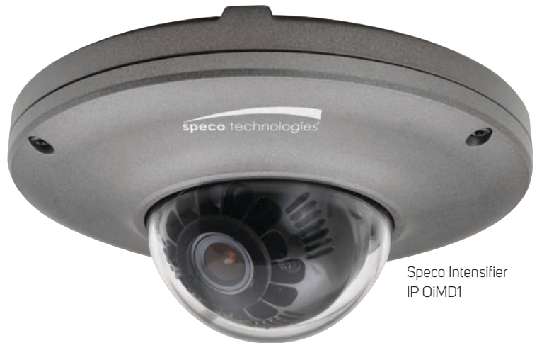
Speco Intensifier IP OiMD1

The OiMD1 camera is one of two IP-based camera models in the Intensifier IP line offered by Speco Technologies. The technology for these cameras was adapted from the analog cameras in Speco's product line of CCTV equipment. I have seen and read many of their advertisements for this technology but this is the first time I have had to work with one of these cameras. According to the product literature the camera can provide usable color images in very low light situations — this is one of the big selling points for the Intensifier line. Speco also states the cameras can accomplish this with the existing ambient light and they don't have to utilize any infrared (IR) illumination.