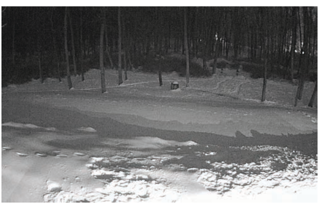
Low light images from the IP 0iM01 are almost unusable ( top ). Other similarly priced cameras have better low light response ( bottom ). Both pictures show the same scene at the same time.

pects of the camera in low light conditions. When I set the camera up overlooking a dimly lit area I expected to see some pixilation at first; what I saw was a mostly unusable image. I went in and performed several menu changes on the unit in an attempt to amp up the camera's performance at night. First I forced the unit from auto to night, disabling the IR cut filter. Next I changed the Intensifier preset setting from indoor to low light. Following that I changed the dynamic noise reduction to 20 (maximum selection) and changed the sharpness to 10 (middle of the selection). The resulting image was better than what I started with but not what I expected from the camera. I tried to capture a JPG image from the Speco software but every time I tried nothing appeared to be saved so I made a screen capture of my Web browser.