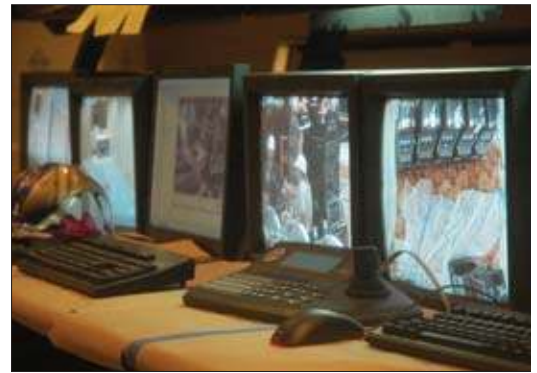
While most casino surveillance directors are not sold on replacing their analog cameras, many are investing in converting their recording methods to digital.

While this type of system generates the most "buzz" on the market, most gaming professionals who have carefully examined such systems agree they are totally inappropriate for gaming. The video switching from camera to camera is slow, often as long as a second or two, while analog systems switch between cameras in a