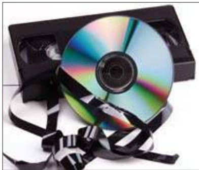
Slowly but surely, casinos are finding digital recording to be more reliable than VHS tapes. Digital systems have come a long way, and digital recording is turning into the new universal standard.

Likewise, a failure of the digital system, resulting in even downtime for maintenance, will not affect live viewing of images. In fact, one system design incorporates additional matrix outputs that can shunt video signals to a backup encoder/server/storage combination automatically in the event of