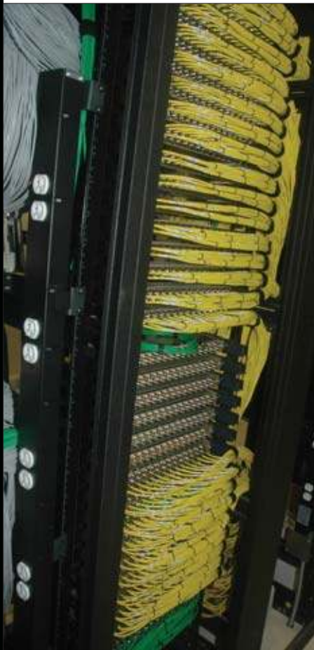
Analog matrix switching systems provide real-time switching and control with very little latency. Applications that do not require time-intensive camera control can utilize the virtual matrix.

Other side effects can include dropped frames, stuttering image and an inexplicable loss of quality because of network traffic. Virtual matrixes may have the functionality of real analog matrix switches, but they do not currently enjoy the level of performance inherent in their real-world counterparts.